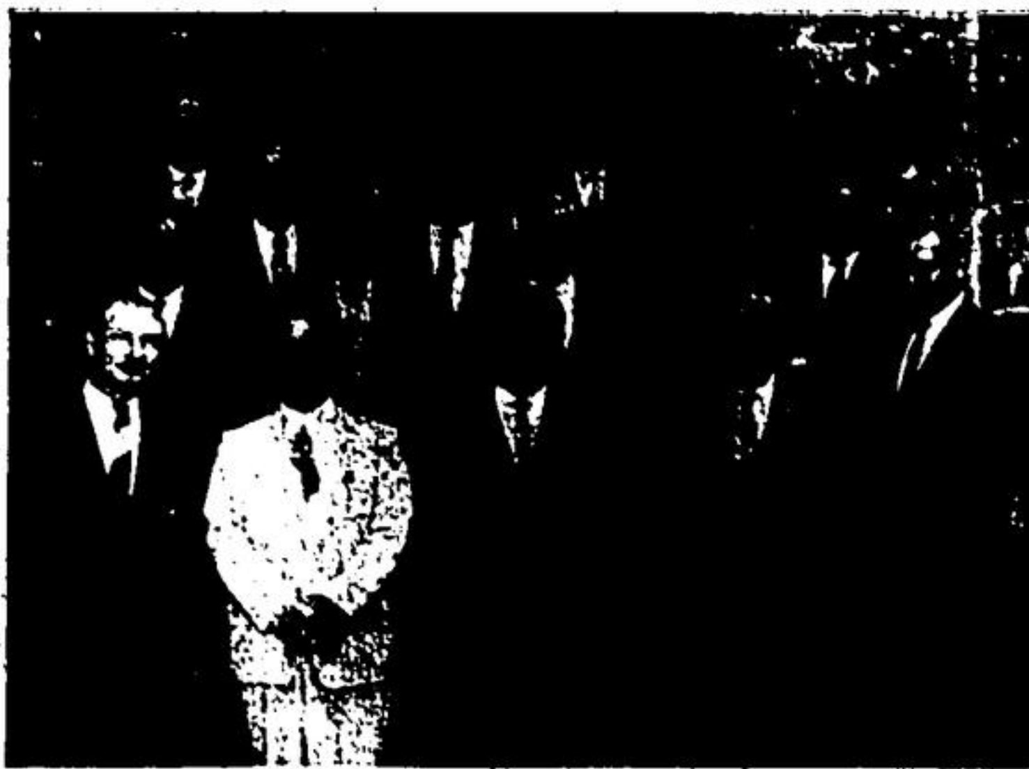
Pictured above are the members of the Session and Board of Managers of Knox Presbyterian Church, who are busy with the Centennial Committee on plans for the celebration next month.