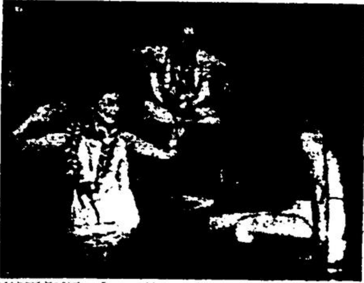
HAPPY TALK - France Noyes, Juanita Hall, and John Kerr react to the famous 'South Pacific' happy talk scene in the Twentieth Century Fox De Luxe Color release opening today at the Brampton Drive-In Theatre.