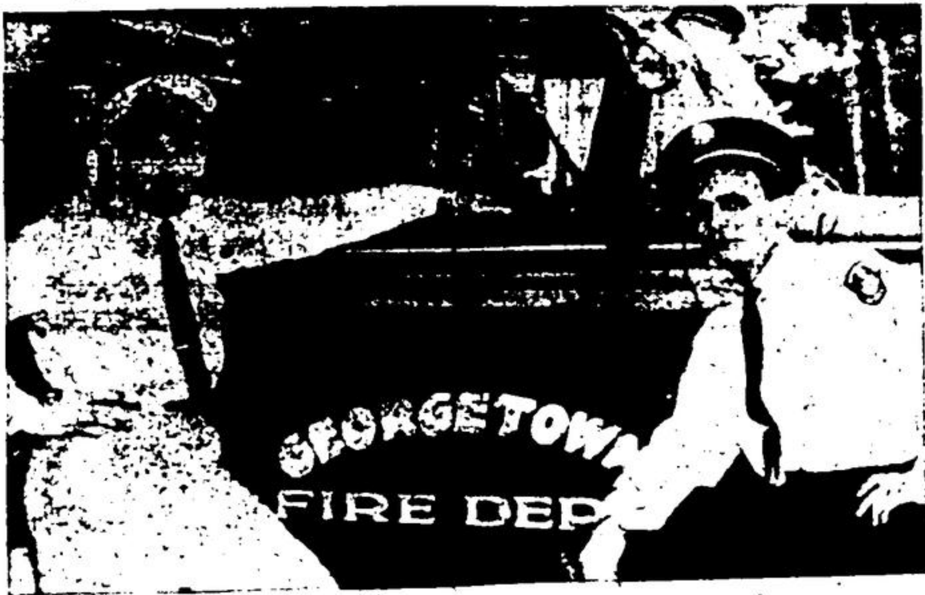
CAPTAIN AND CHIEF