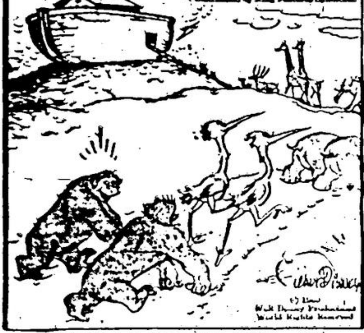
"By the way, do you play shuffleboard?"