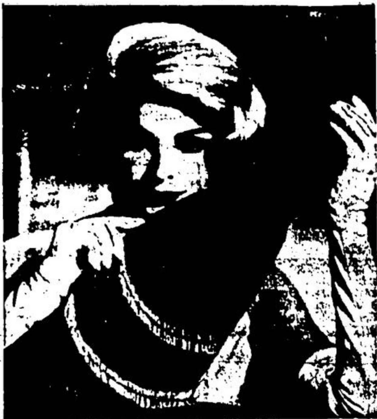
By Tracy Adrian

This evening bag is a luxurious accessory imported from France. The delicate hand-beaded and beaded fringe edge make it a unique complement to party dresses. Made of silk satin, the bag has a concealed zipper closing under the top flap. There is more than enough space inside to accommodate all the varying essentials, yet the purse still keeps a slim line.