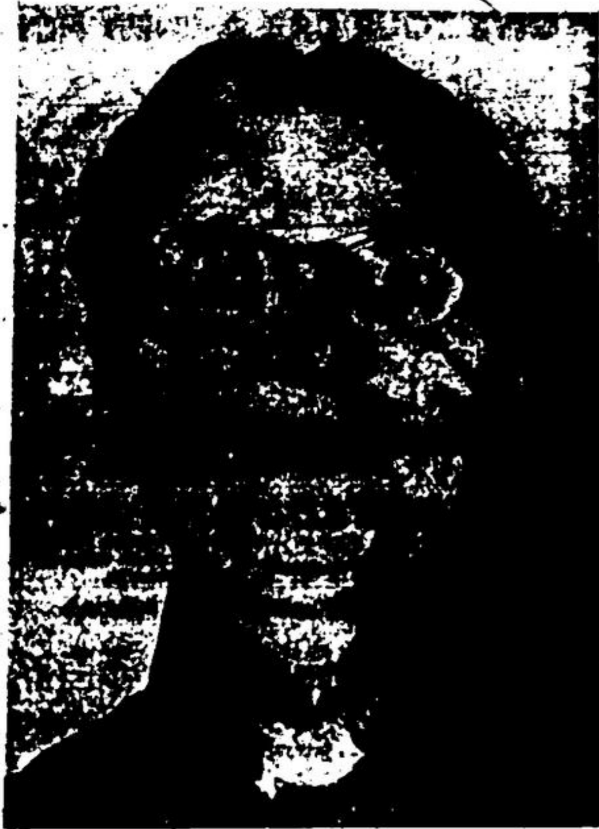
GLADYS AYWARD, internationally known through filming of her life story as 'The Inn of the Sixth Happiness.' Miss Aylward will speak in St. John's United Church in town on March 27.

Gladys Aylward, who rose from the position of a London parlourmaid to become a legend in her own lifetime through heroic service in war ravaged China, will speak at St. John's United Church on Sunday, March 27th, at the 11 a.m. service of worship and also at the Sunday School at 9:45 a.m. Miss Aylward, "The Small Woman" of the best seller under that title and whose story was condensed in the Reader's Digest and portrayed on the screen in "The Inn of the Sixth Happiness," is now on a speaking tour of Canada. She is the guest of World Vision, Inc., a service agency giving emergency aid to more than 75 million orphans in 100 countries. She dreamed of going to China as a missionary, but was unable to obtain backing because of her lack of education. So she determined to go anyway without help from anyone. In 1930, equipped with railroad tickets, her Bible, nineteen cents in coins and two one-pound traveller's cheques, Gladys Aylward travelled across "impossible" Siberia. Her life in a remote mountain town of northwest China be-