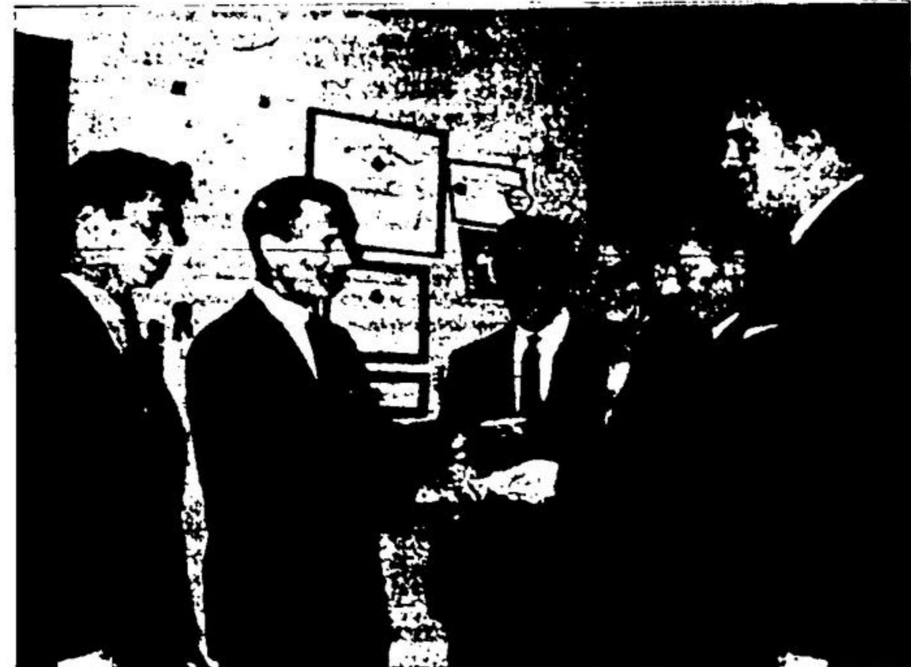
PLAQUE FOR QUALITY PERFECTION