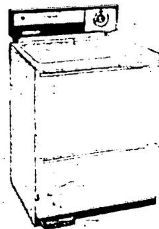
Model No. TDA-923

LOOK - Outstanding Offer On AUTOMATIC CLOTHES CONDITIONING DRYERS