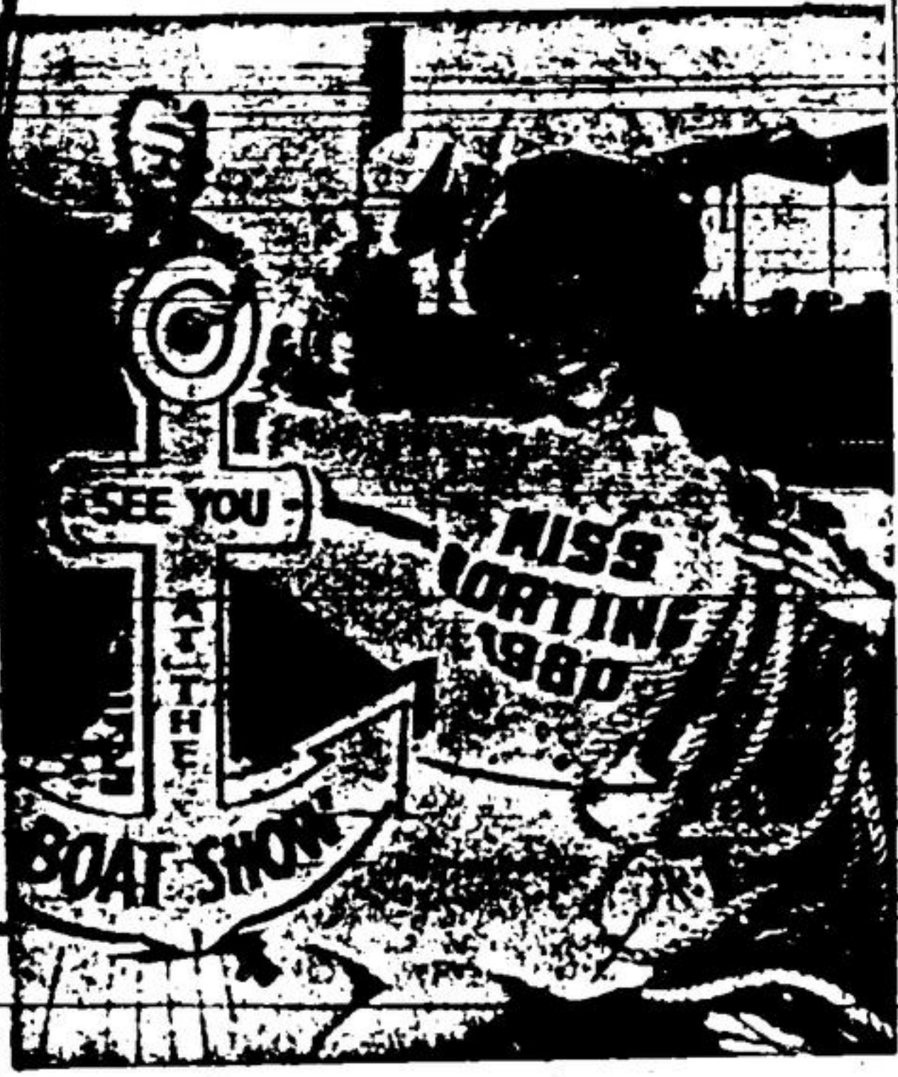
NAMED "MISS BOATING" for 1960, honey-haired Barbara Weeks of Elobicoke, will reign over the 2nd annual Canadian Boat Show in the Automotive Building, Exhibition Park, from February 5 to 13 next. This will be the greatest collection of boats, motors and marine equipment ever assembled under one roof in Canada. Equipped with a trim figure, statistics about "Miss Boating" are 36-24-36.