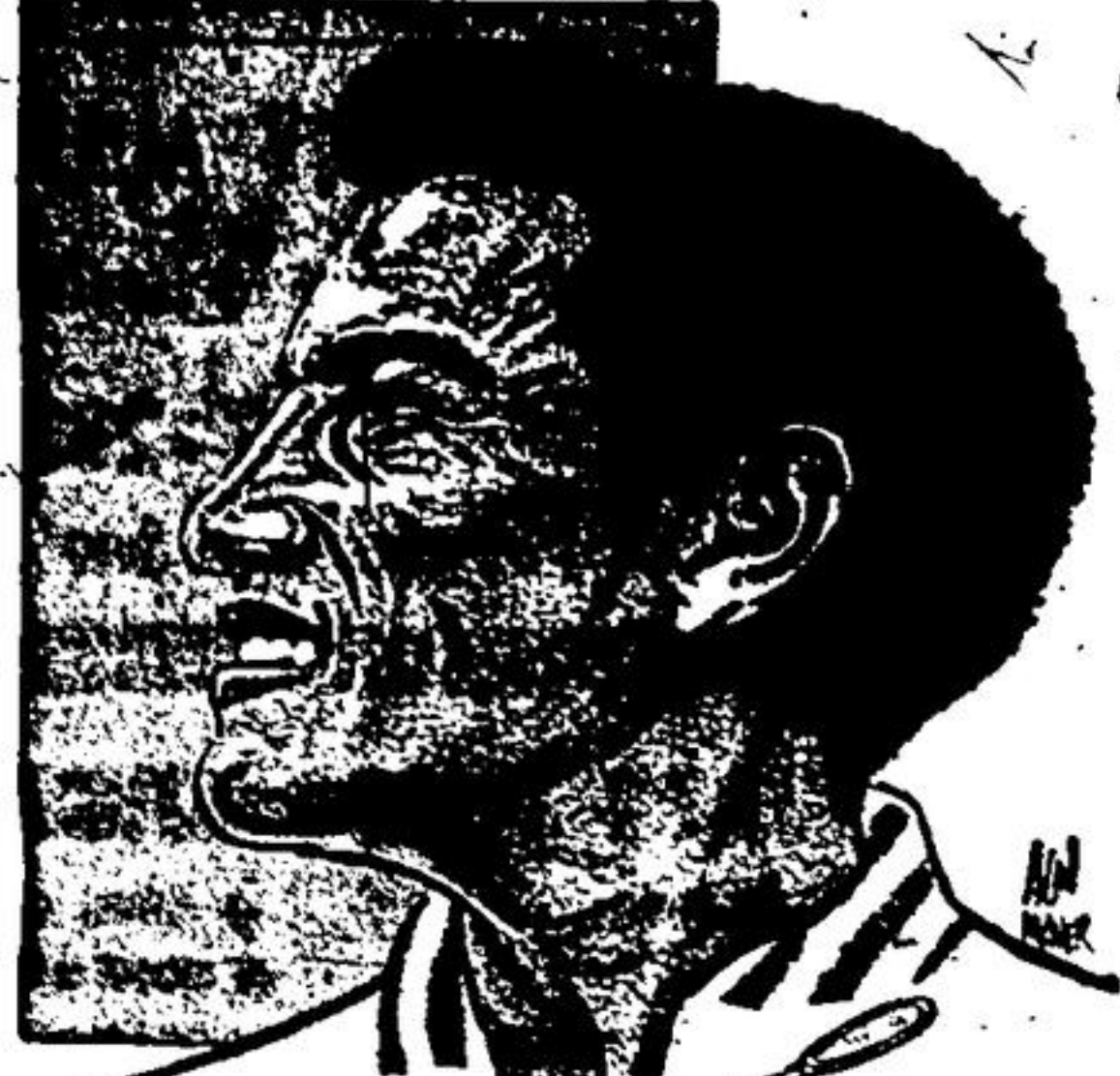
ALEX OLMEDO, 23-YEAR-OLD TENNIS STAR FROM PERU, MAY HAVE "THE LOOK OF EAGLES IN HIS EYES," BUT IT'S THE EAGLES ON AMERICAN COLLARS HE'S BEEN COMMITTED AT LEAST 35,000 OF THEM FOR HIS FIRST YEAR AS A PRO.