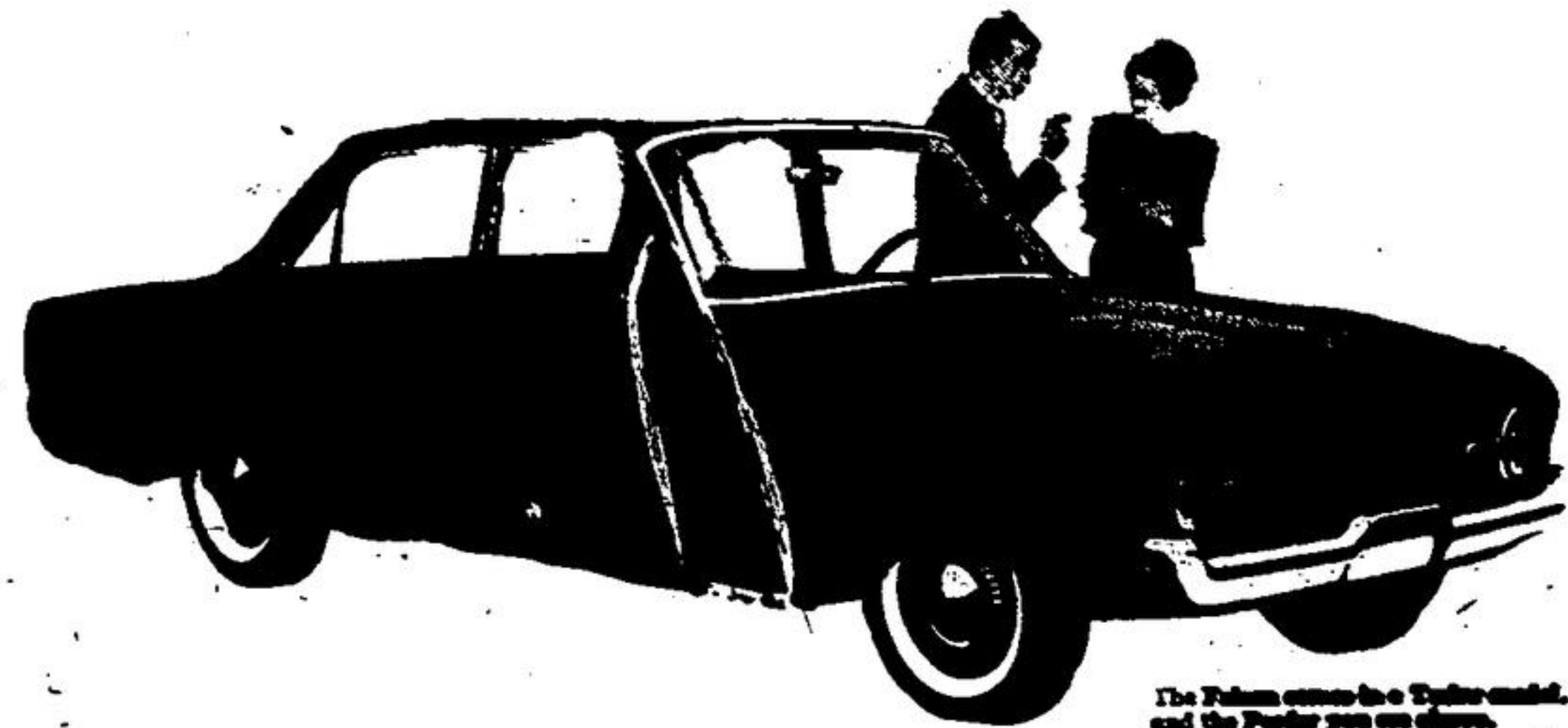
The Falcon comes in a Super model, and the Panther you see above.