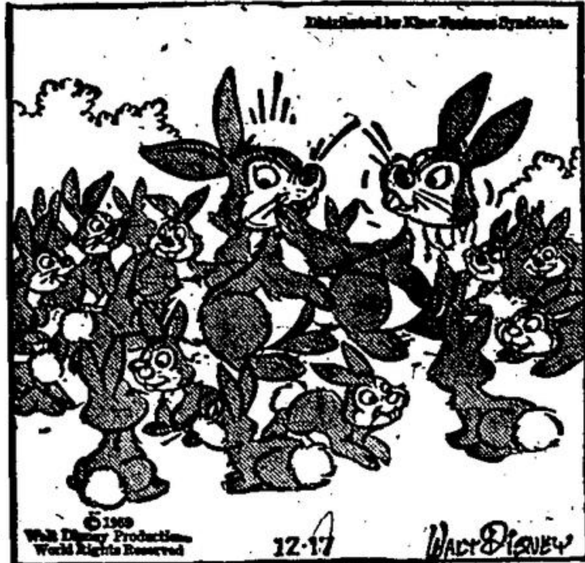
"Better be nice to 'em, dear—they outnumber us badly!"