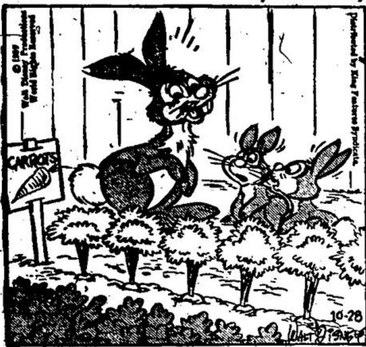
"You can't trust this guy—last year every other carrot was a horse-radish!"