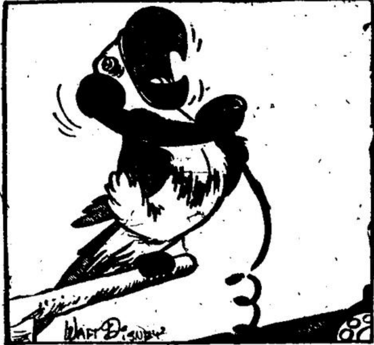
"No, no, Operator! Not person to person—parrot to parrot!"