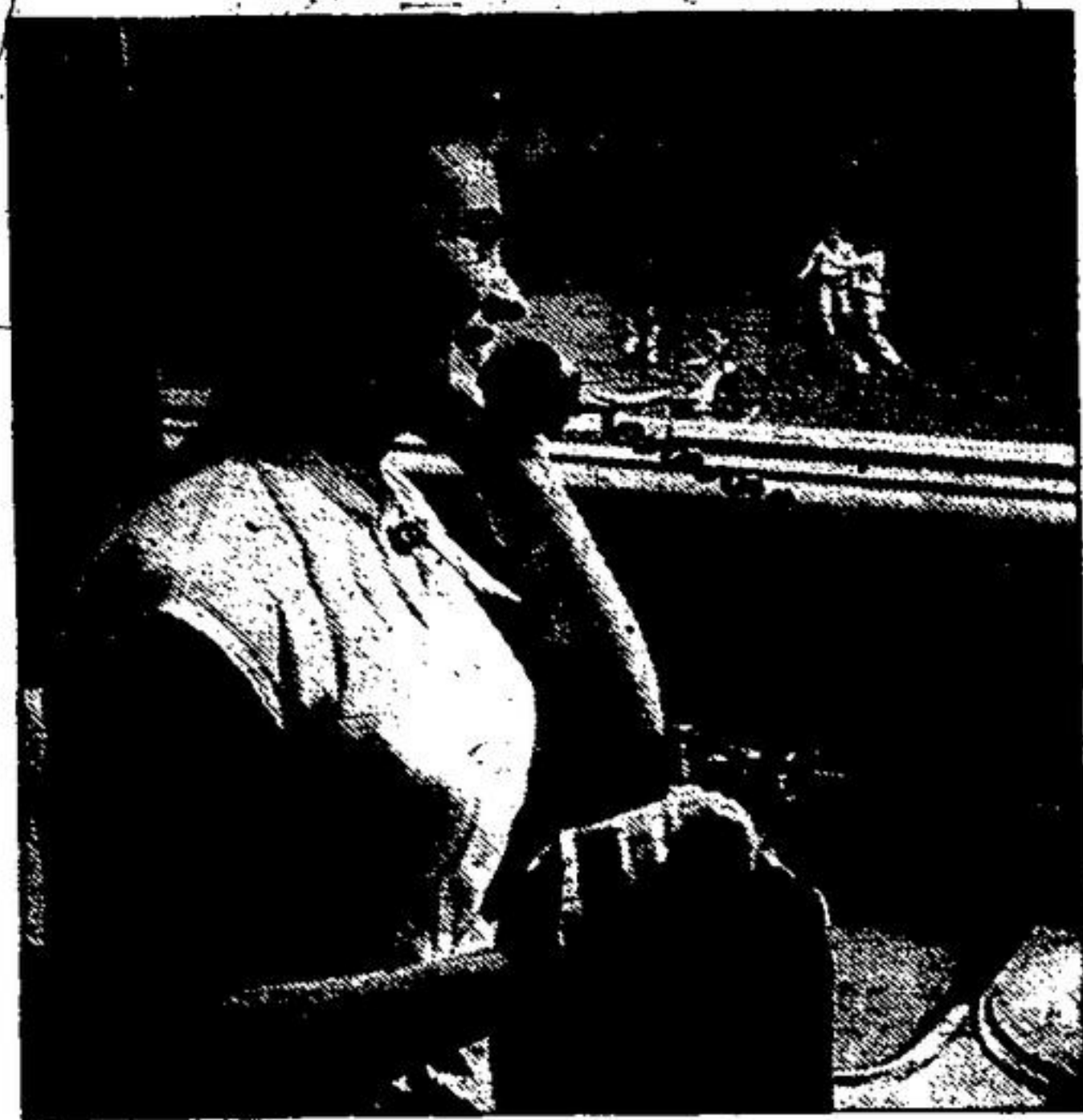
"Fine... I'll send them right home"

Motor License Bureau CLOSED FOR VACATION AUGUST 17th to 29th, (Inclusive)