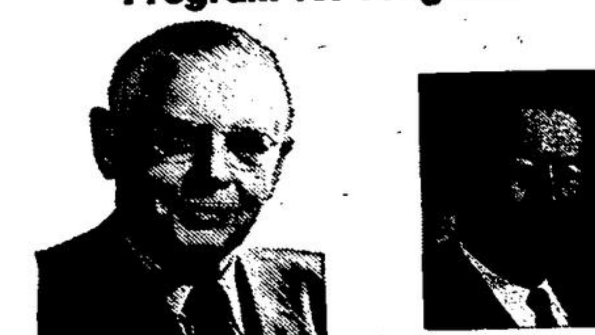
PREMIER FROST FOR ONTARIO STAN HALL for HALTON

The dynamic achievements of the Government of Premier Leslie Frost have benefited all of our citizens. Ontario's standard of living has never been higher.