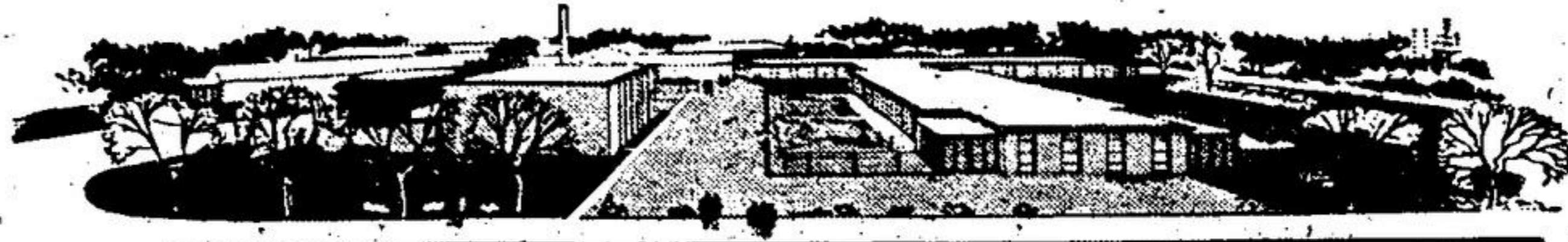
Halton Centennial Manor Addition SHORE AND MOFFAT ARCHITECTS TORONTO

The contract for construction of additional units to Halton Centennial Manor, a home for the aged on Highway 25 on the outskirts of Milton, Ontario, was awarded to Dell Construction Company Limited of Milton, for a total cost of $920,000.