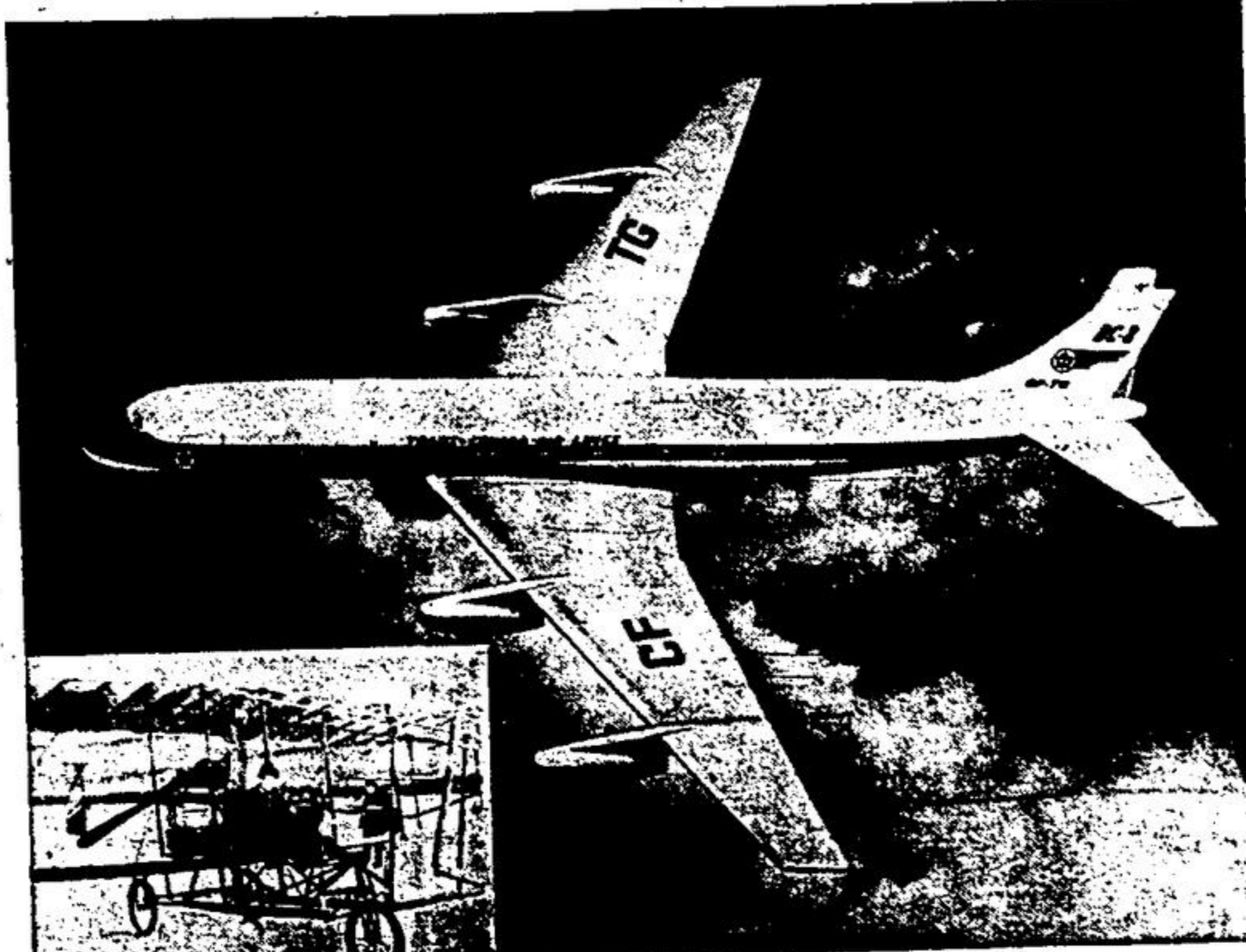
Fifty years ago, on February 23, J. A. D. McCurdy flew his Silver Dart (inset) at Baddeck, N.S., marking the first powered flight in Canada. Since that historic event, development in aviation has taken tremendous strides. Another milestone will be reached later this year when Trans-Canada Air Lines takes delivery of the first of its six huge DC-8 Jetliners which will fly at 550 miles an hour and carry 127 passengers. Mr. McCurdy will be taking part in many of the Golden Anniversary celebrations throughout Canada this year.