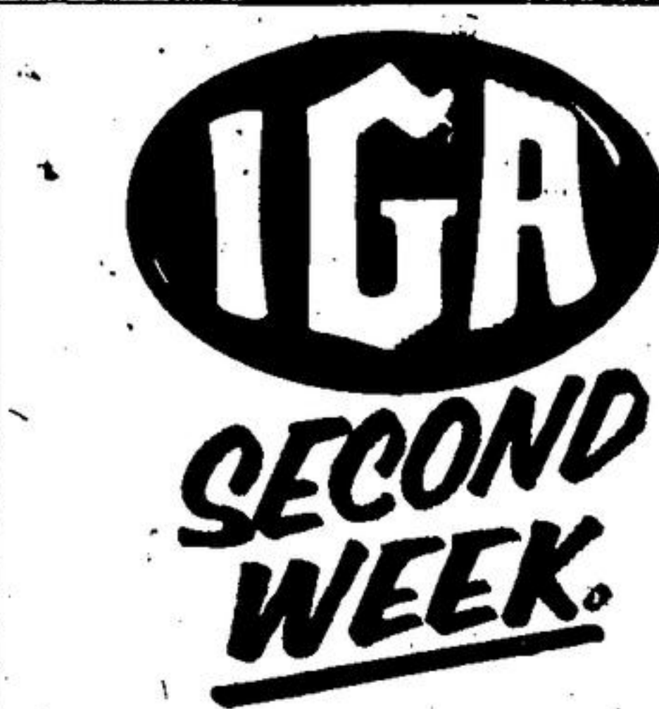
TABLE RITE BEEF ROUND UP