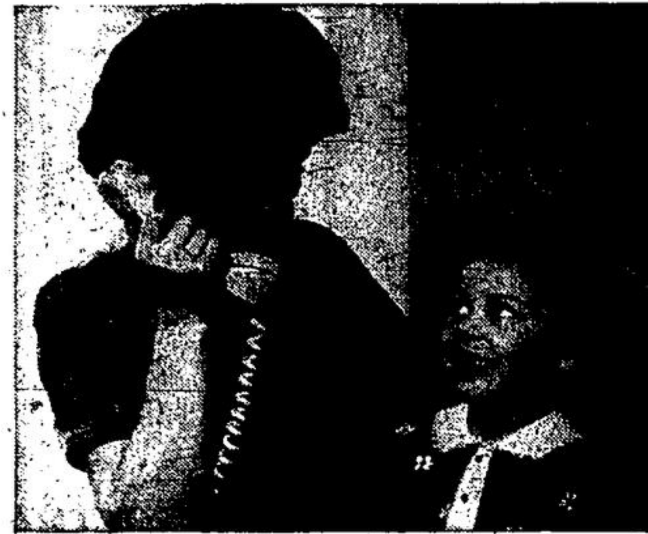
"Yes, Doctor... Wednesday will be fine!"

devotional and business period was held after which the members sewed for the girls for an hour. Refreshments were served and several new members were welcomed.