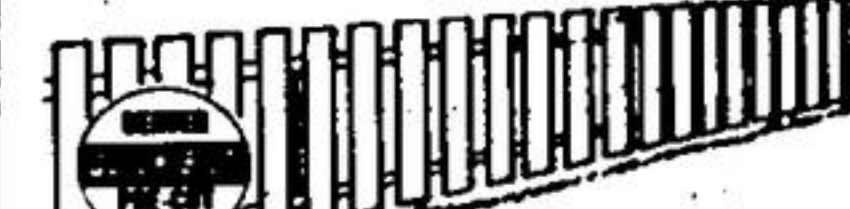
NEW "Straight Line" PICKET FENCE

Delivered pre-cut to length — one 6 ft. post 4" x 4", two rails 1" x 4", two rails 1" x 6" and a 3 ft. vertical rail 1" x 4" per 8 ft. Section . . . $3.60.