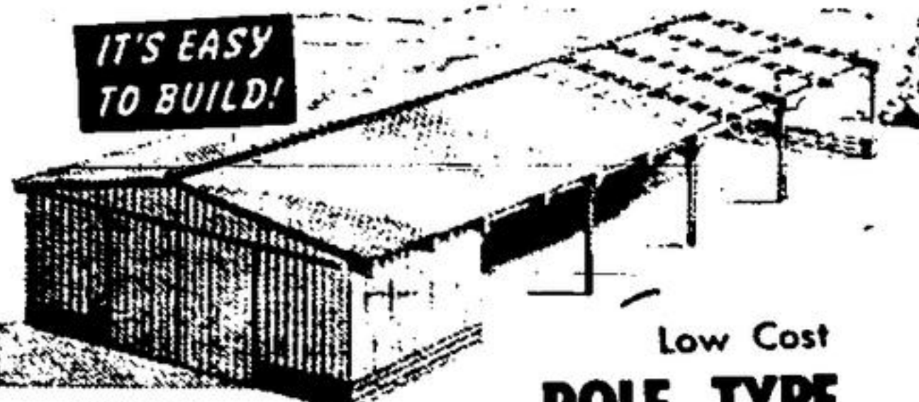
Low Cost POLE TYPE BUILDINGS

For greater profits farming today demands new buildings that provide greater efficiency at a low cost. Beaver Lumber can help you build these from the top three farm construction methods of today — pole type, rigid frame and the laminated arch rafter. All three are economical, flexible in design, structurally sound and inexpensive. Plan and build now for greater profits. — see your Beaver Lumber manager — he has complete working plans for all 3 buildings.