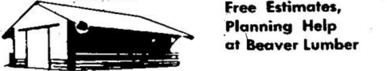
62 x 96 ft. LOUNGING SHED ONLY $3075