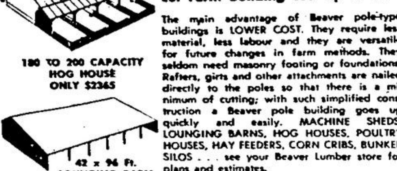
180 TO 200 CAPACITY HOG HOUSE ONLY $2345

Savings on Material and Labour cut Farm Building cost up to 50%