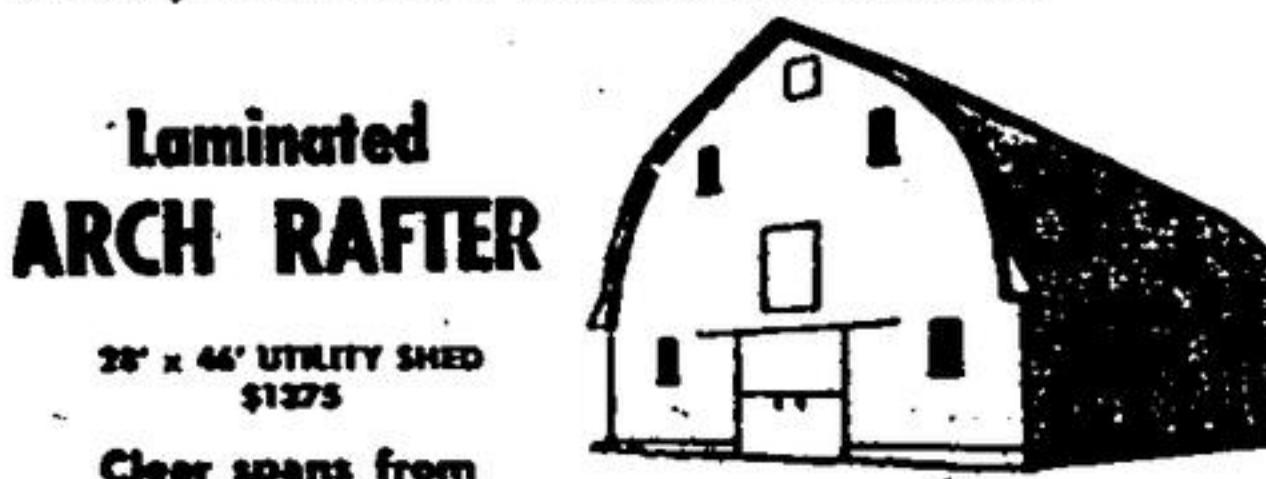
Laminated ARCH RAFTER

Adaptable to almost every farm building need, large or small, the Beaver rigid frame building has been readily accepted on Ontario farms. Practical in every respect, the rigid frame building is easily erected whether you build it yourself or have it built. Plans at Beaver Lumber.