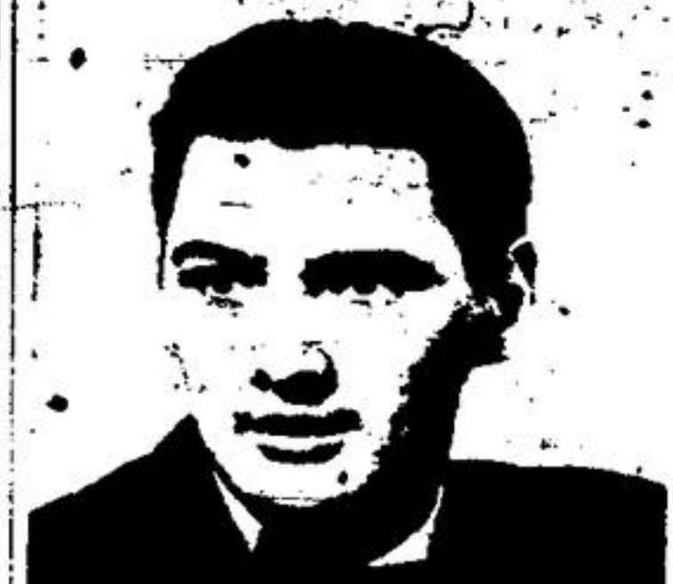
Nerve Pressures Must Be Corrected . . .

There is no relaxation. High speed, long hours, and taut nerves result in tiring muscles to such an extent that the whole skeletal framework finally sags, causing nerve pressures and the usual train of results—lower back pain, shoulder pains, neck aches, and headaches. Unquestionably, the canvas and leather belts and girdles, worn by many tractor operators, are of some value. However, even that type of support cannot make up for proper body mechanics, which is lost when the muscular system sags because of overwork and overstrain.