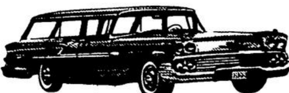
The eye-filling new Nomad... 4-door, 6-passenger station wagon.

'58 CHEVROLET! The biggest, boldest move any car ever made!