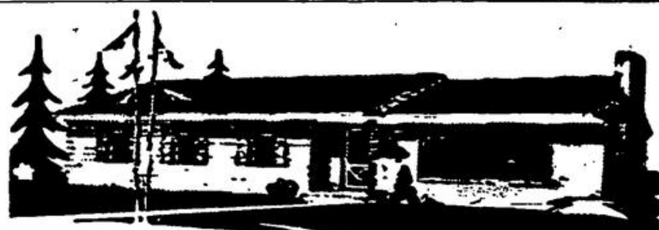
PARK DISTRICT . . . $2500 DOWN

For details about these and the many other listings we have . . . Phone TR. 7-3245 - at - 137 Main St. N. SEE CHARLES DYKSTRA