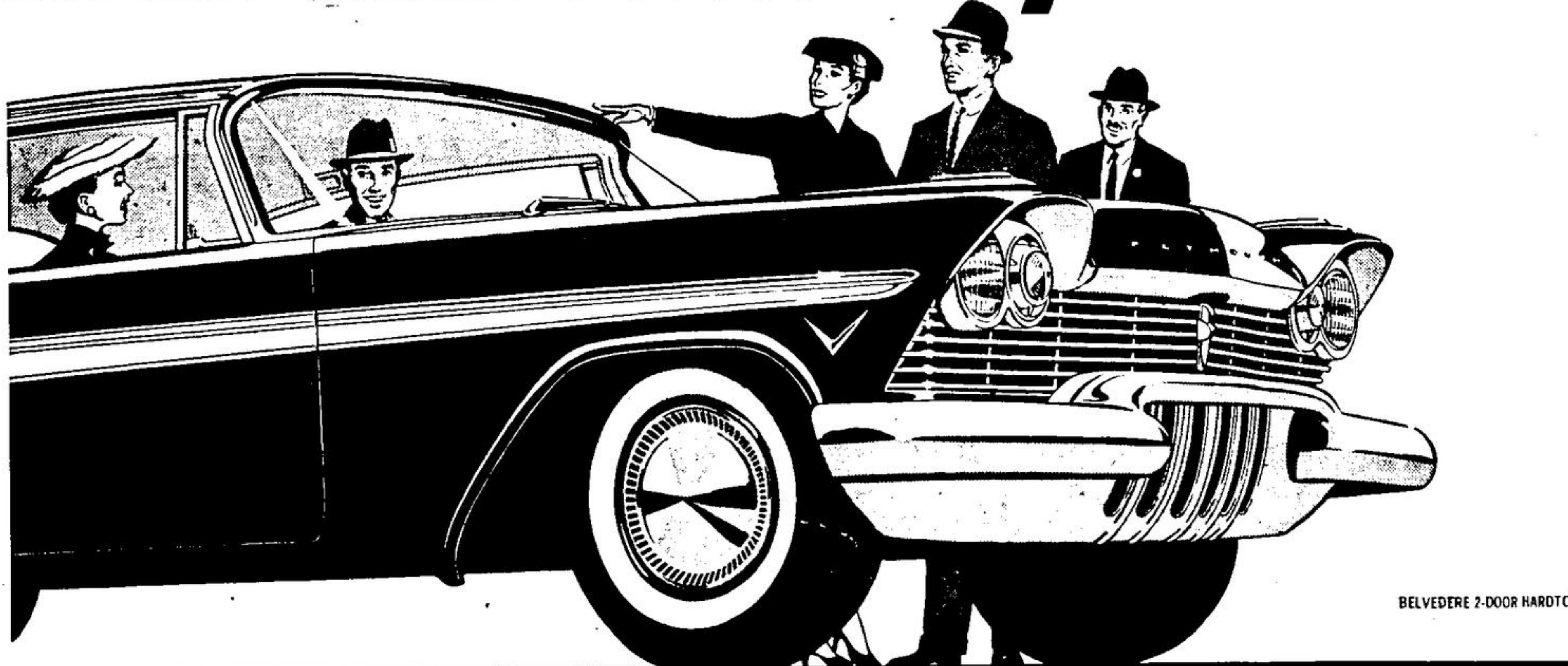
BELVEDERE 2-DOOR HARDTOP