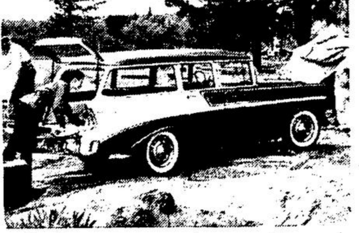
Load 'er up, point 'er at pleasure, and let 'er go! Chevrolet takes the miles like she owned them!