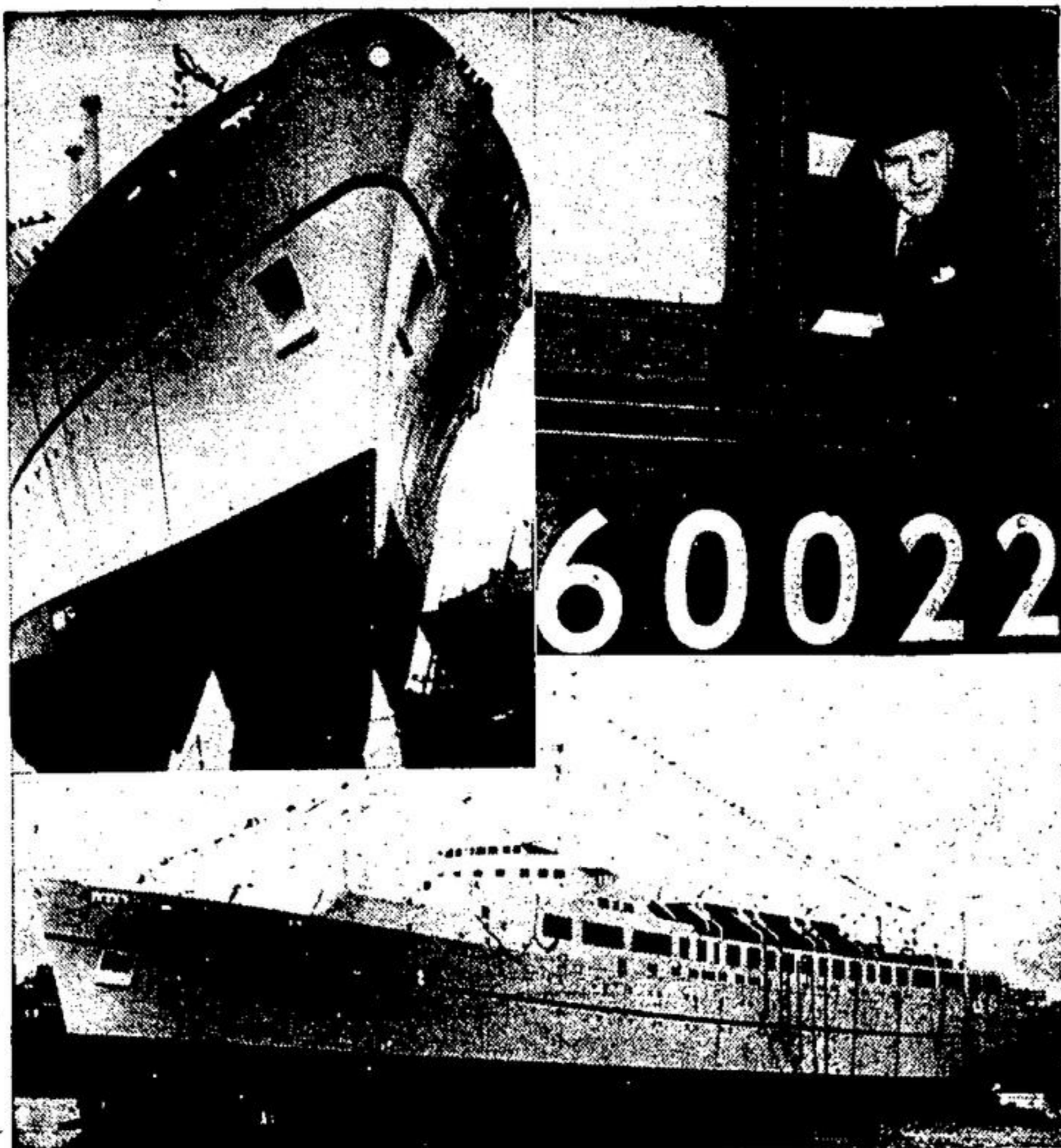
ENGLAND LAUNCHED: The 26,000-ton "Empress of England" — the second of the Canadian Pacific's new ocean going liners — is shown sliding down the way (upper left) following her launching by Lady Eden, wife of the Prime Minister of Great Britain, at Walker-on-Tyne. The new liner, sister-ship of the "Empress of Britain," rests on the River Tyne, (lower inset) following her launching. N. R. Crump, president of the Canadian Pacific Railway, is shown at the throttle of the world's fastest steam locomotive which pulled the train leaving London for Newcastle carrying those attending the launching of the new liner. The locomotive, known as the Pacific class "Mallard" is holder of the unbroken speed record of 126.4 miles per hour. The "Empress of England" will go into trans-Atlantic service between Montreal and Liverpool in the spring of 1957.