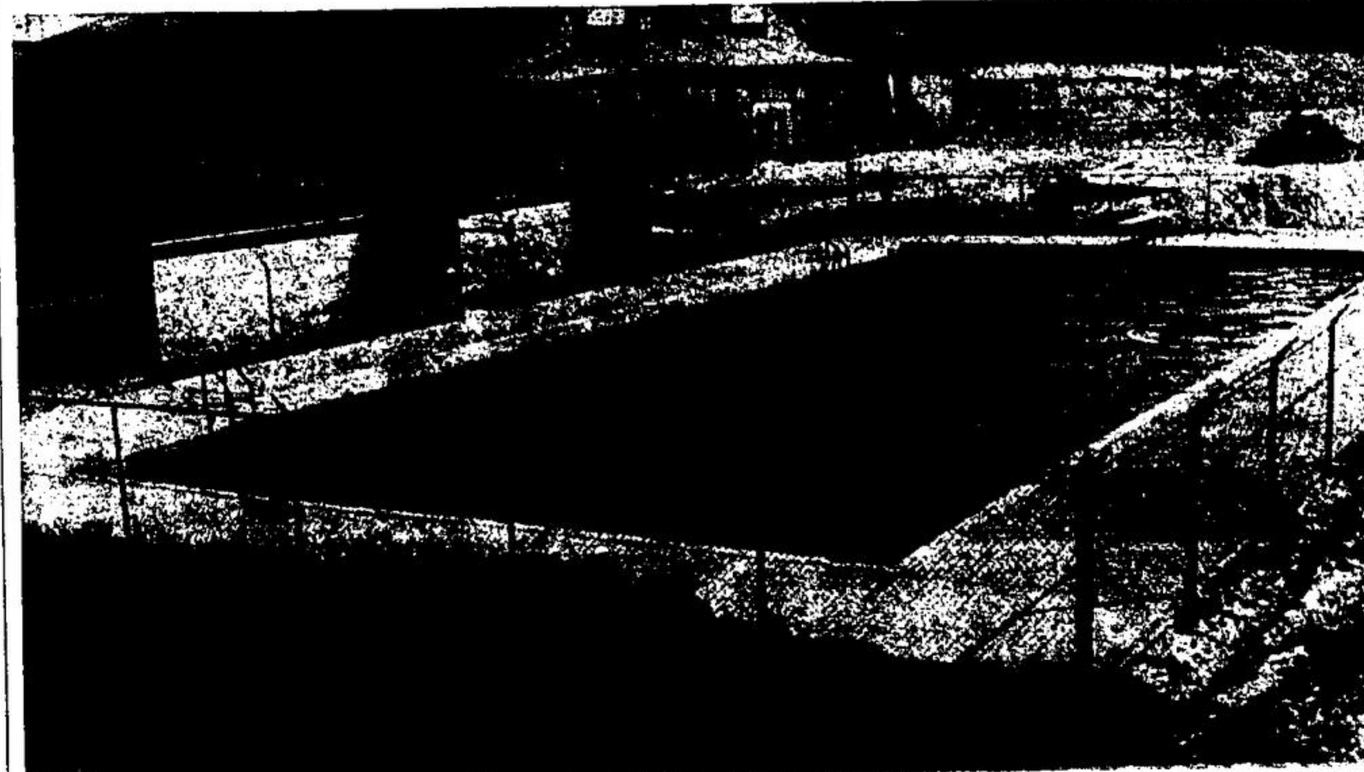
FILLED WITH WATER, but not able to open for lack of $18,000, Georgetown's new community swimming pool behind the arena sits forelorn and unused. Whether it will be available this summer depends on the generosity of the Georgetown public.