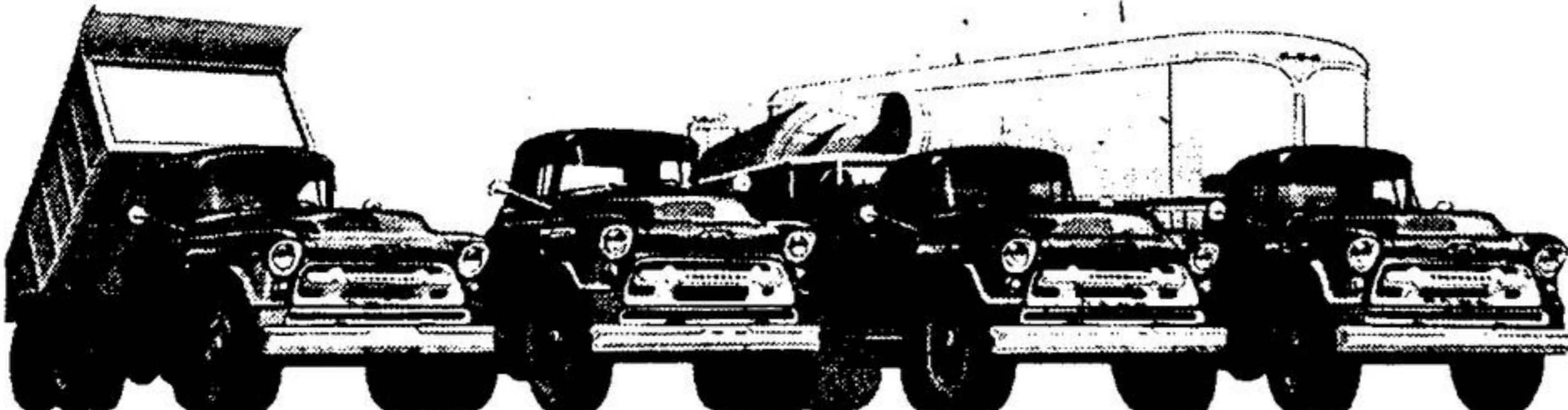
New W1900 Series truck with Triple-Torque tandem. New 7000 and 9000 Series L.C.F. (Low Cab Forward) cab. New 1900 Series truck illustrated with concrete mixer unit. New 1700 Series model shown as tractor with semi-trailer.