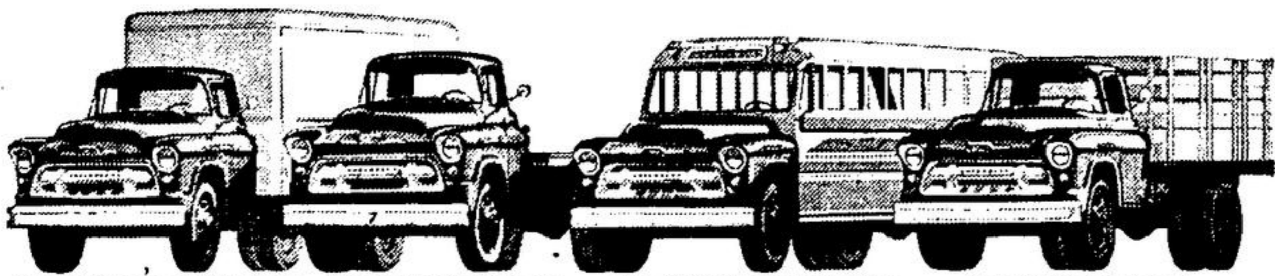
New 1600 Series truck pictured with van body. New 1800 Series L.C.F. with platform body. New 1600 Series school bus chassis. New 1500 Series stake truck.