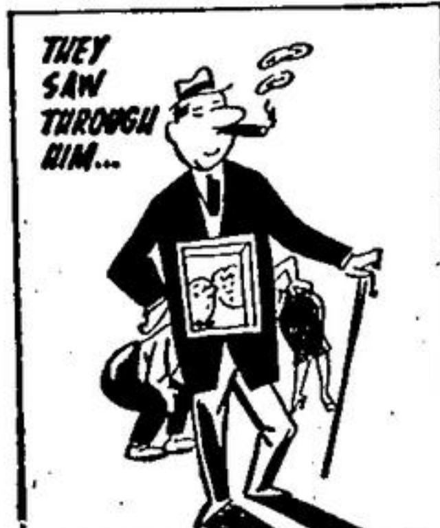
HE WAS NOT A MILLIONAIRE - HE WAS MERELY SMILING FOR THE 'YOD WAC' ENJOYING THE GREAT SAVINGS BY BEING A CUSTOMER OF