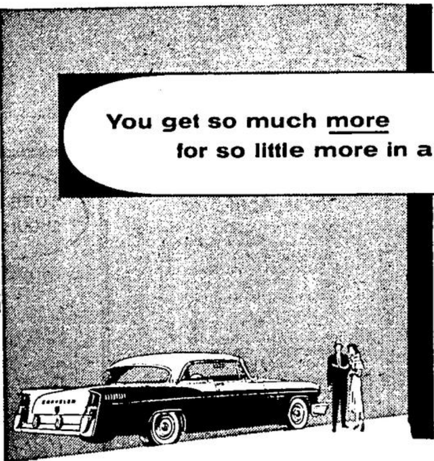
Chrysler New Yorker 2-door hardtop

Watch Climax—Shower of Stars weekly on TV. Check your newspaper for date and time.