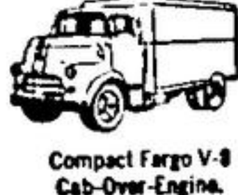
Compact Fargo V-8 Cab-Over-Engine.