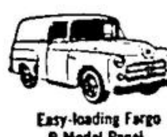
Easy-loading Fargo B Model Panel.