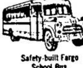
Safety-built Fargo School Bus.