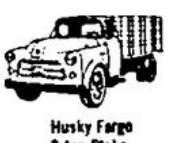
Husky Fargo 2-ton Stake.

FARGO —trucks built to fit your job 5,000 lbs. G.V.W. to 46,000 lbs. G.V.W.; up to 65,000 lbs. G.C.W.