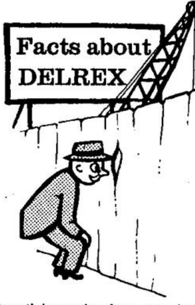
(Seventh in a series of messages about Delrex and what it means to the Georgetown area)

ONE MILE SOUTH OF BRAMPTON ON HIGHWAY NO. 10 Always TWO BIG FEATURES