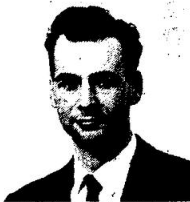
E. TETRAULT, D.C.

Migraine means one-sided headache. They were first isolated from the general group of headaches by Aretaeus of Cappadocia in the first century A.D.