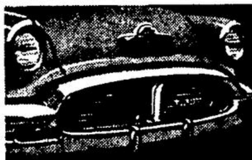
Immediately apparent, and stylishly impressive, is the "Integrille" Bumper which symbolizes the "in-flight" theme of '56 Oldsmobile. The grille and bumper form a single gleaming unit.