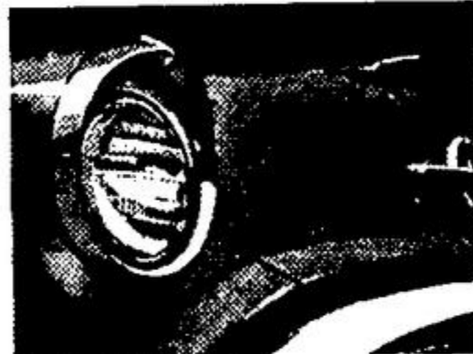
Bolder hooded headlights of new T-3 type are incorporated with sweeping front fair-ways fenders.