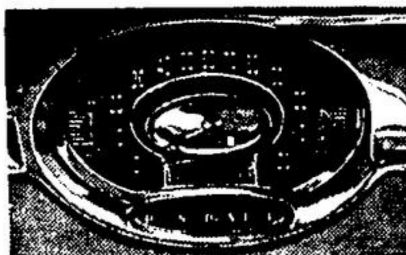
The instrument cluster is artfully arranged so you can see the safety lights for all the instruments with only a split-second glance.