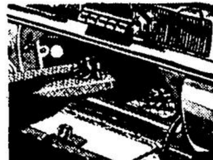
New, wider-than-ever glove compartment... sweep-blended into the instrument panel... provides room galore—right at your finger-tips!

Step out of the ordinary . . . find out for yourself what wonderful things Oldsmobile can bring to you