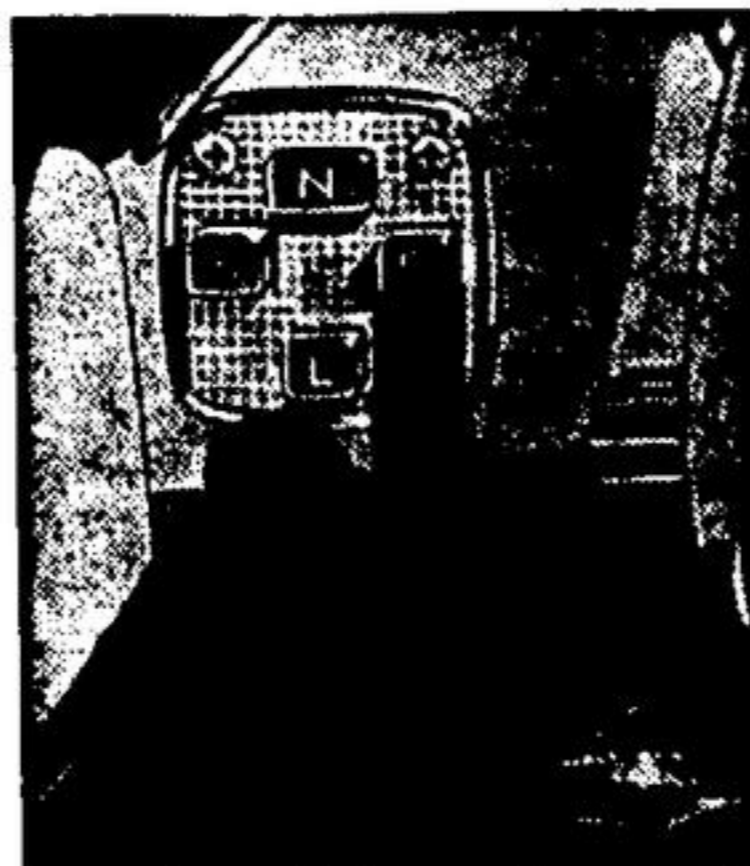
Push-button controls for PowerFlite automatic transmission are safety-positioned at the driver's left. There are no sleeve-catching levers!

There's one smart way to travel the road to success. And that's in a fabulous new DeSoto with Flight-Sweep styling!