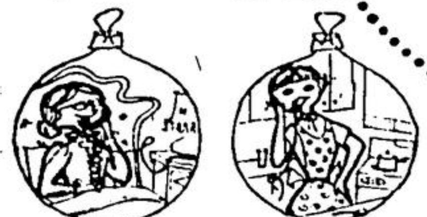
FOR GRANDMA'S BEDROOM FOR MOTHER'S KITCHEN

... and so easy to order... just give us a call