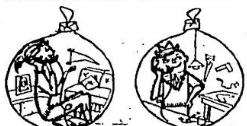
FOR HIS OR HER ROOM FOR FATHER'S WORKSHOP