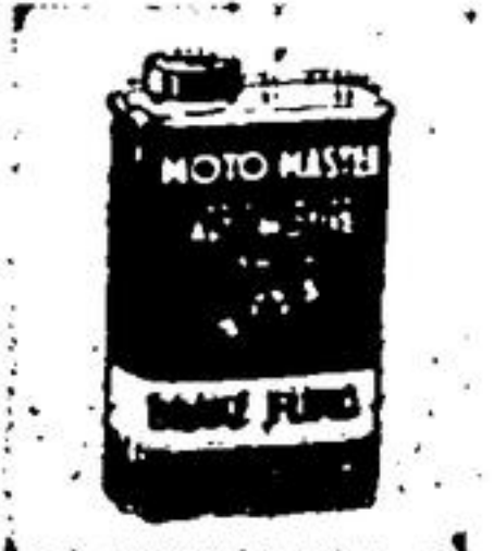
Heavy Duty Brake Fluid

Superior to original brake fluid supplied by new car manufacturers.