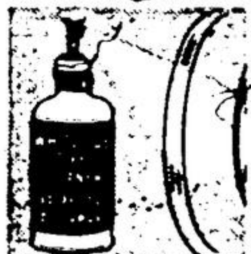
Whitewall Tire Cleaner

Simply spray on—wipe with rag and glass. Makes tires gleam.