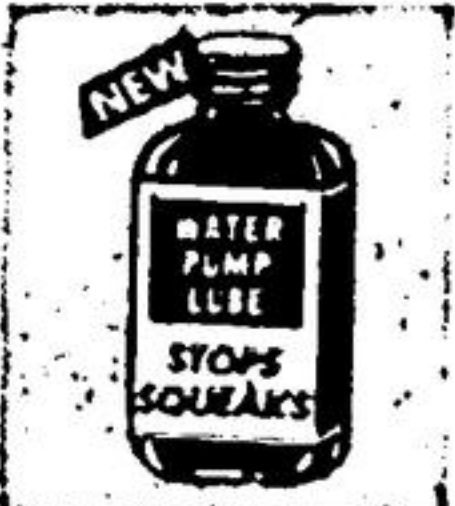
Water Pump Lubricant

Add to radiator coolant/coolant to keep pump bearings, stop ruff and corrosion.