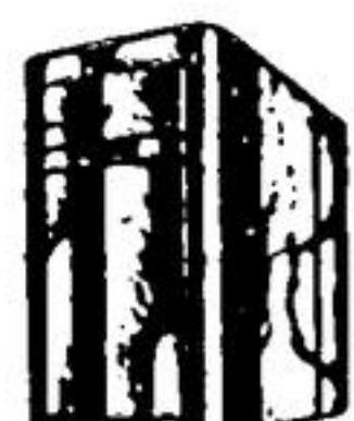
A complete line of Williams OIL-O-MATIC Domestic Oil Burners and Furnace Burners.

Complete Manufacturers MORCH MANUFACTURING LIMITED St. Catharines, Ont.