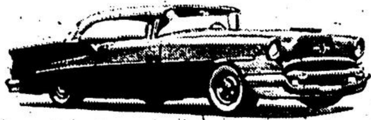
Illustrated—Oldsmobile Super '88' 2-Door Hardtop