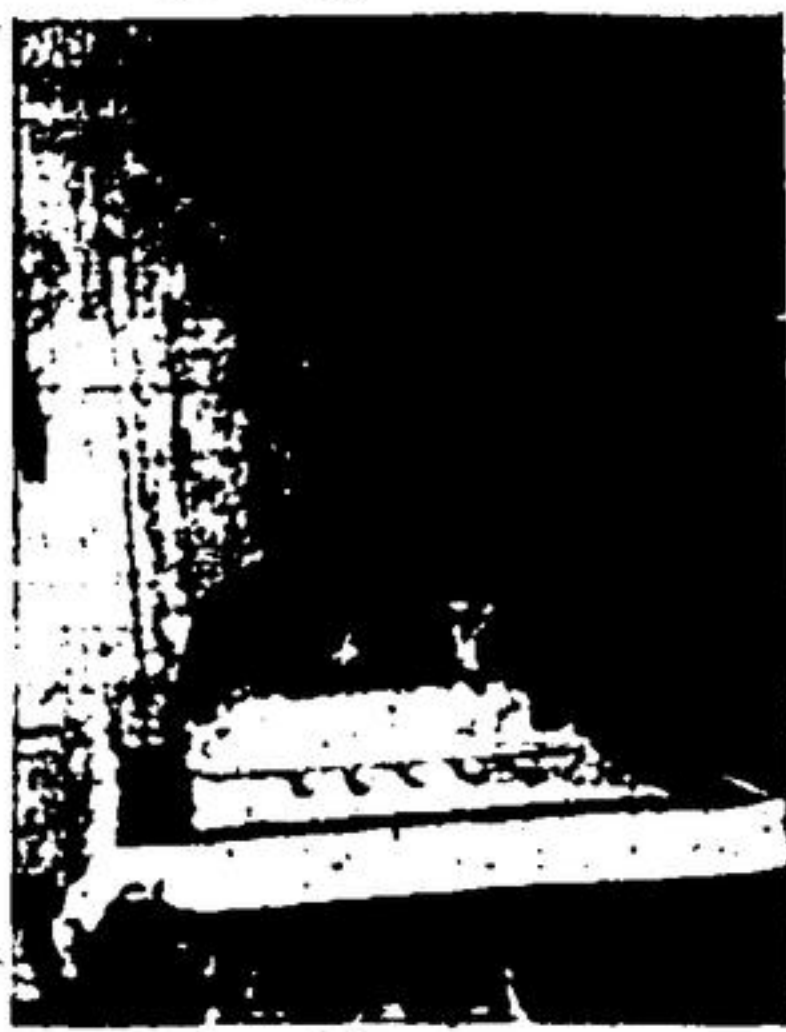
100 YEARS OLD

—Friday, July 1st is Dominion Day and will be a public holiday in Georgetown, with stores closed.