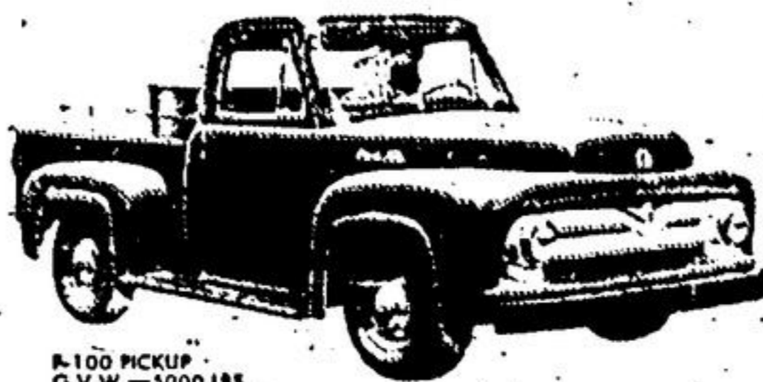
1-100 PICKUP G.V.W.—2000 LBS. PAYLOAD—UP TO 1618 LBS.

They're here—the new "Money-Makers" —Ford Triple-Economy Trucks for '55! Come in and see them—get the full story on Triple Economy—look under the hood, for money-making short-stroke engines, new overhead-valve design in every series. Examine the cabs, for driver-saving comfort, new convenience features. Check the payloads, see how Ford's money-saving capacities fit into your hauling picture. For economy—for durability—for suitability—haul with Ford Trucks . . . the new "Money-Makers" for !!