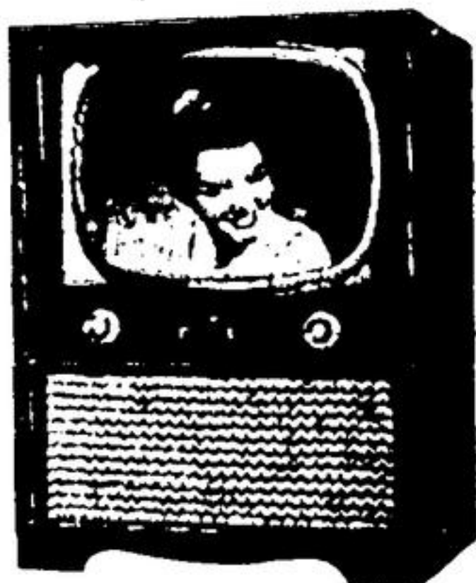
Table Model C21T8 $319.95

at WIGO'S - Georgetown's Greatest TV. Specialty Store