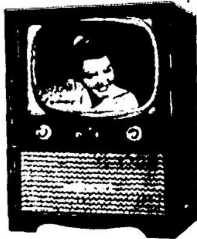
Table Model C21T8 $319.95

at WIGO'S - Georgetown's Greatest TV. Specialty Store