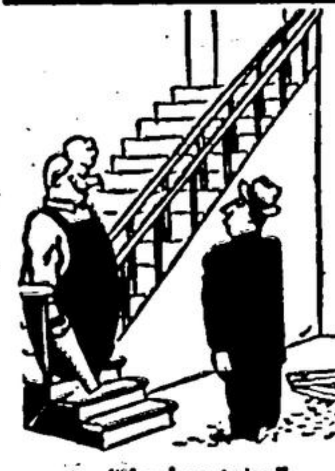
"They have twins."

WE HAVE What You Need in LUMBER and Builders' Supplies