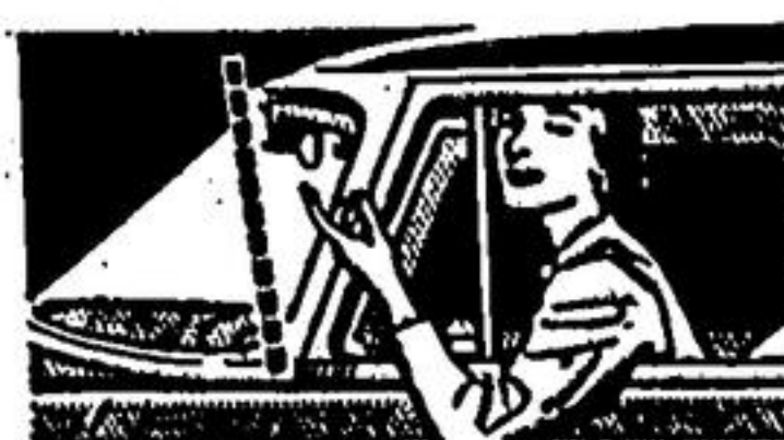
"New Horizon" windshield scores a big advance over earlier wrap-around designs. Its sweep-back posts slip up visibility by putting more glass area up at eye level, where you need it.

Manufactured in Canada by Chrysler Corporation of Canada, Limited