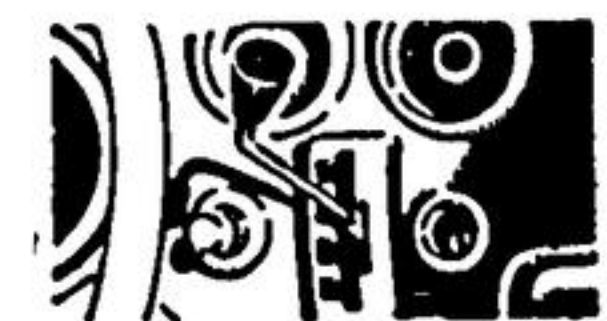
PowerFlite* Flite Control lever, a new styling treatment, is now mounted on instrument panel.