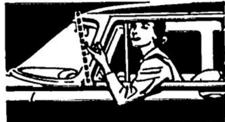
New Horizon full-wrap windshield differs from ordinary wrap-arounds because it wraps around at top corners where you really need it, as well as the bottom. There's full vision from every point of view.