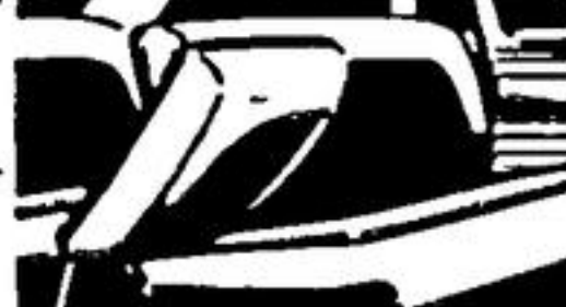
Front seat of two-door models folds 1/4-3/4 . . . allows easy entrance or exit without disturbing front seat passengers.