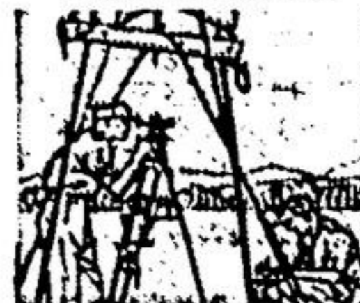
Surveying — still another important skill to learn in modern artillery schools.