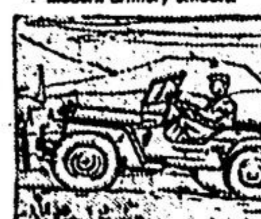
Driver-Mechanics trained in maintenance play their part in the R.C.A.