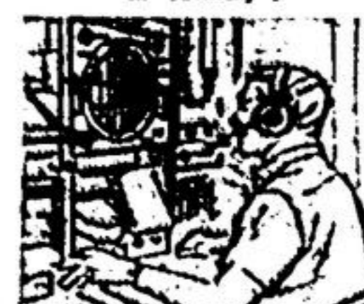
Radio is another of the many tasks of modern artillery.