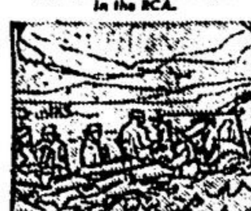
Teamwork is the key to success of Canada's field gunners.

Apply right away: Write or visit the Army Recruiting Centre nearest your home.