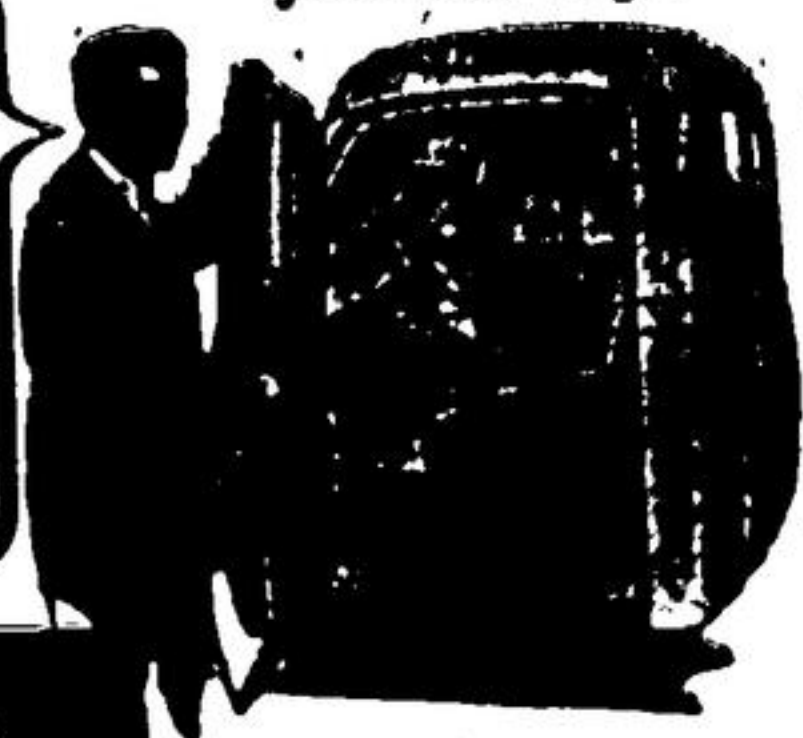
Combo-Value cab, improved steering and transmission. Left-action springs.